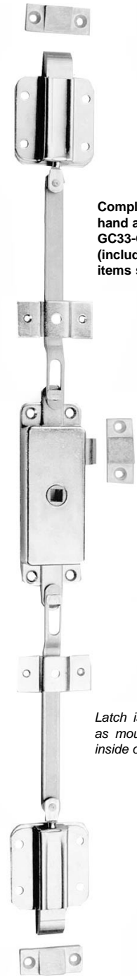
Complete right-hand assembly GC33-G18342 (includes all items shown)